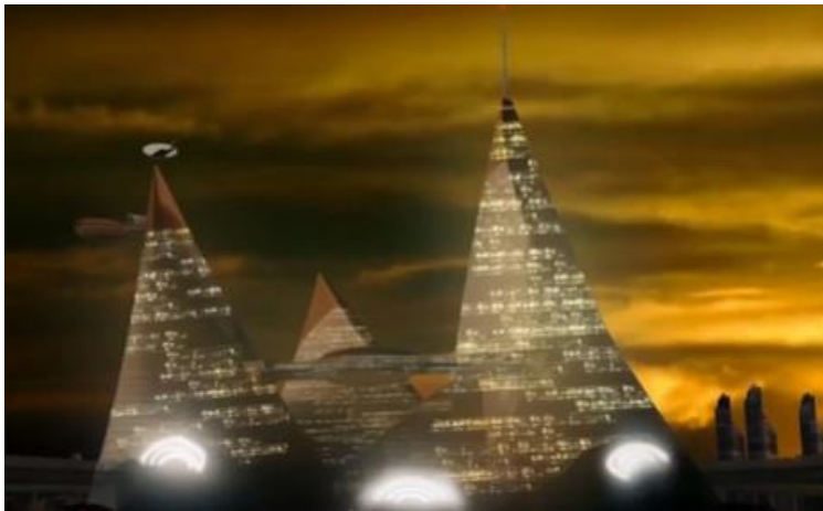
Figure 5: A digital representation of the proposed Dholera Smart City

rhetoric around infrastructure creation and urbanisation in India echoes Gottman in Rostowian “take off” terms (Rostow 1960), but the planned state-directed Indian corridors are running into considerable trouble over their institution.