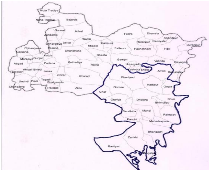
Figure 3: DSIR villages in Taluka Dhandhuka