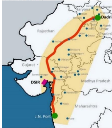
Figure 1: Location map of DSIR

The Gujarat Special Investment Region (SIR) Act, 2009, was enacted to institute investment regions and investment areas in the State in the wake of the DMIC, albeit not exclusively along the corridor. The Act brings within its purview the Gujarat Town Planning and Urban Development Act (GTPUDA), 1976, a tool for the conversion of the existing rural-agrarian land into an urban area.