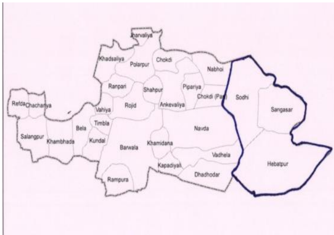
Figure 2: DSIR villages in Taluka Barwala

My access to the area was facilitated by members of the non-government organisation Kbedut Samaj , the State-wide land-rights campaign Jameen Adhikar Andolan Gujarat and the Bhal Bachao Samiti comprising residents of the Dholera project area.