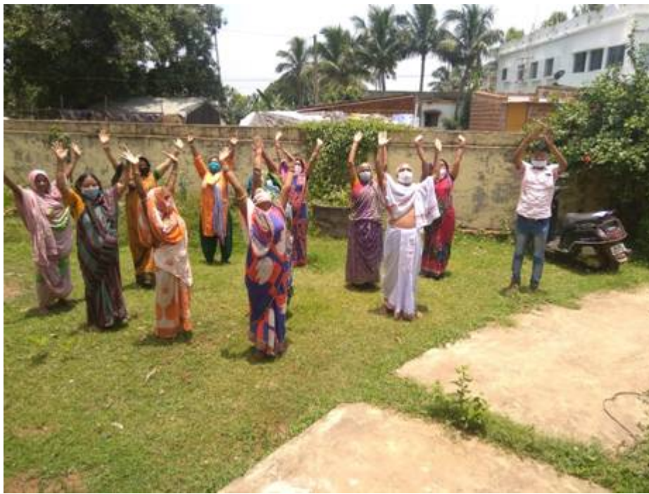
#Yoga session at Phubasahi Khordha HWC, Odisha

HWCs also provide a strong backbone for the implementation of the eSanjeevani platform of Health Ministry which includes the eSanjeevani Patient-to-Doctor OPD and eSanjeevani-HWC which provides Doctor-to-Doctor teleconsultation service. 23,103 HWCs have started providing teleconsultation services to citizens. More than 7.5 lakh teleconsultations have already been conducted through these platforms. The eSanjeevani-HWC was rolled out in November 2019. It is to be implemented in all the 1.5 lakh Health and Wellness Centres in a 'Hub and Spoke' model, by December 2022. States need to set up dedicated 'Hubs' in Medical Colleges and District hospitals to provide tele-consultation services to 'Spokes', i.e. Health & Wellness Centres (HWC).